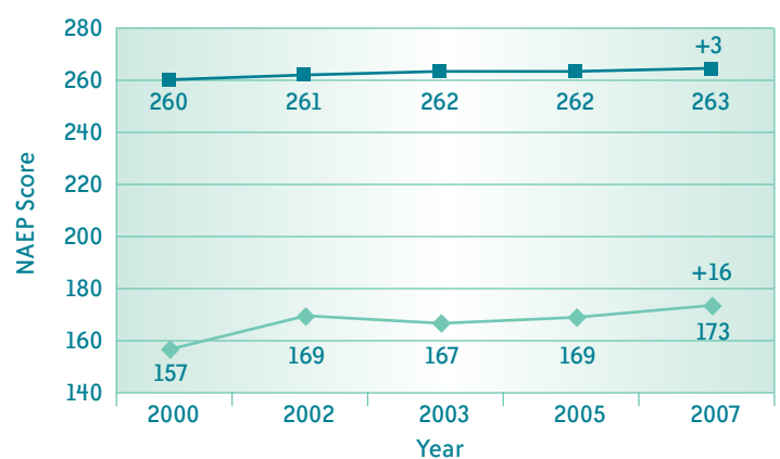
Minimal Progress at the Top 4th Grade Reading NAEP scores, 2000-2007 (90th and 10th percentiles)